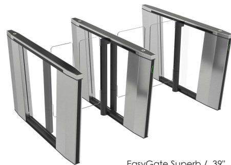
EasyGate Superb / 39" 990 mm