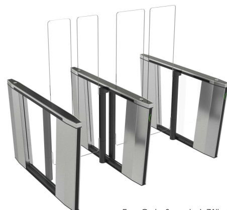
EasyGate Superb / 71" 1800 mm