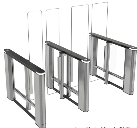
EasyGate Elite / 70.9" 1 800 mm