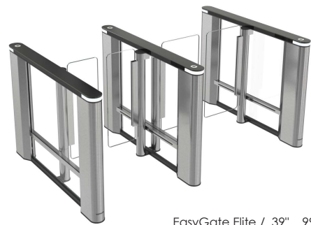
EasyGate Elite / 39" 990 mm

Arc layout Staggered / diagonal layout Flag wing